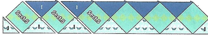
Side Border Make 2

To make the border top and bottom strips, sew 6 section 5's and I's together as shown.